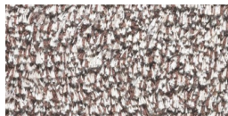
060 Light beige